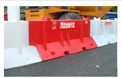
STURDY Road Guard Dimensions: Length: 2.43m (2 m road coverage) Height: 1.075m Width: .66m Product Code: 384 - A