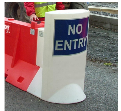
End Road Guard Dimensions: Length: .830m Height: 1.325m Width: .66m Product Code: 386 - A