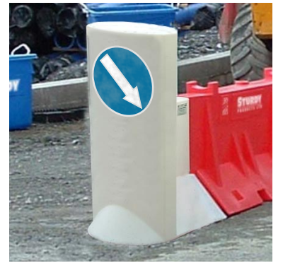
Starter Road Guard Dimensions: Length: .830m Height: 1.325m Width: .66m Product Code: 386 - A