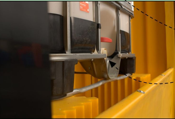
1200LT IBC Tank