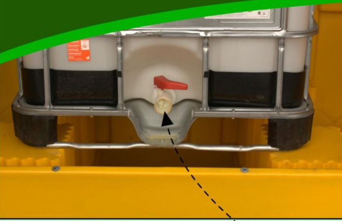
1000LT IBC Tank