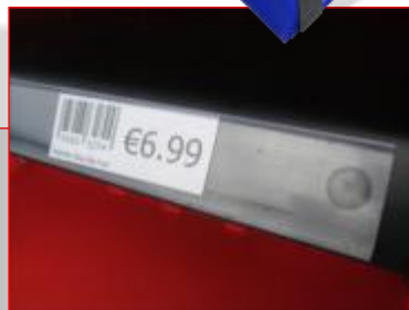
Point of Sale Strips