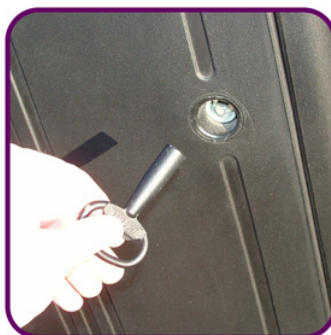
Triangular Key Lock