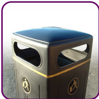
4 way Aperture